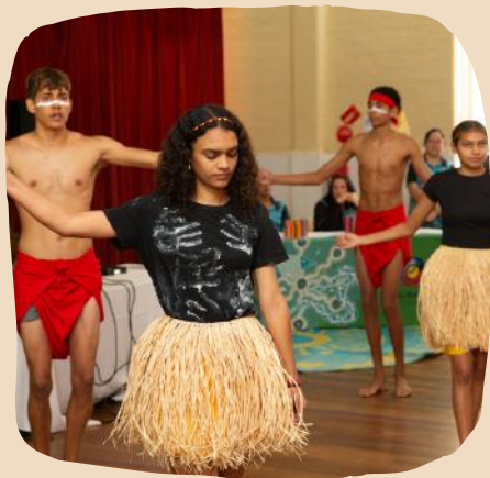
Members of our Youth Group performing traditional dances